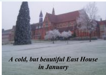
A cold, but beautiful East House in January