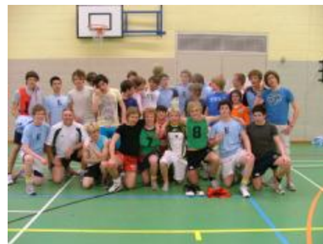
The survivors from last year's East House Charity football day!