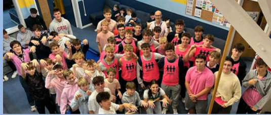
All in pink (nails too!) for Mufti day

At MNF, both Junior and Senior lost to Cubitt by 1 goal, 2-3 and 1-2.