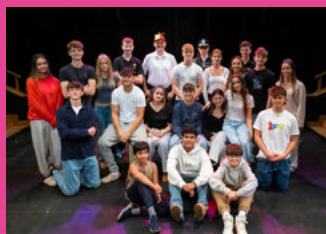
House Play & awards