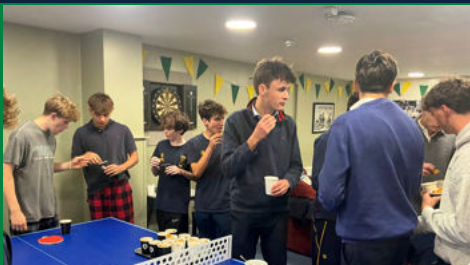
Big Brother social