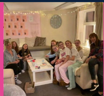
Fourth Form bracelet making