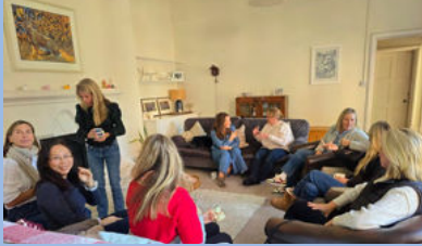
Lower Fifth parent coffee morning