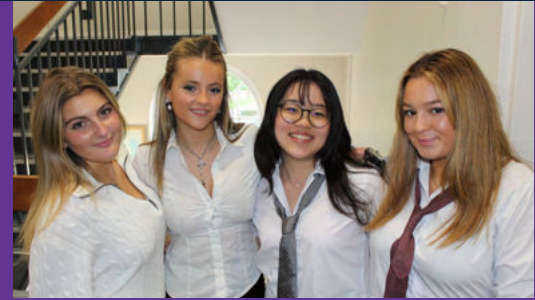
East/Martlet House Play performance