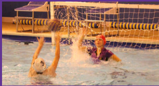
Thank you for all of your support for our Charity night Waterpolo