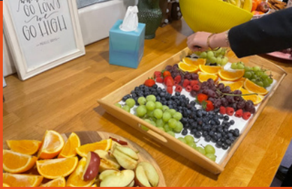
Fruit at break time on Wednesday Toasties for the Lower Fifth