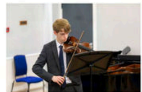
27 NOVEMBER 2024 SENIOR MUSIC COMPETITIONS (STRINGS, VOICE & GUITAR) MUSIC