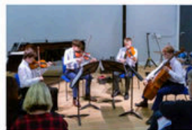
11 OCTOBER 2024 UPPER SIXTH MUSIC AWARD HOLDERS IN CONCERT MUSIC