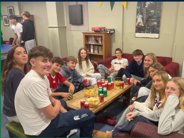
Upper Fifth social with West