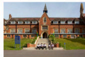
12 OCTOBER 2024 OPEN DAY OPEN EVENT