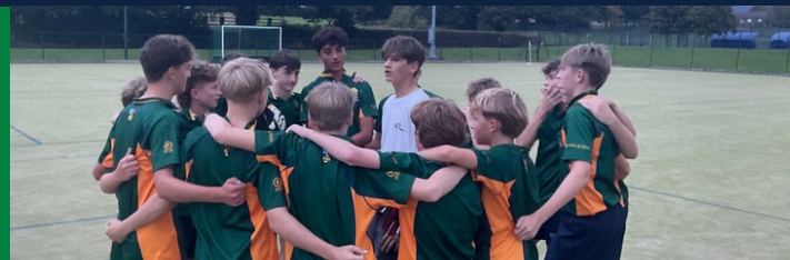
Junior Monday Night Football