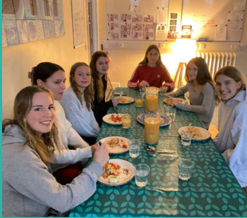
Emeralds are our first family to have dinner together. Others are to follow.....