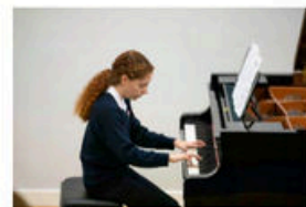
22 NOVEMBER 2024 JUNIOR LUNCHTIME CONCERT MUSIC