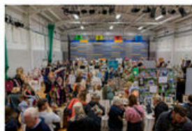
9 NOVEMBER 2024 CRANLEIGH CHRISTMAS FAIR CHRISTMAS