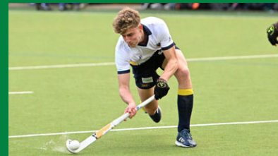
1st team hockey