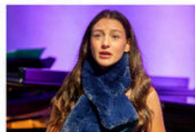
15 NOVEMBER 2024 'SOMETHING FAMILIAR, SOMETHING PECULIAR...!!!' MUSIC