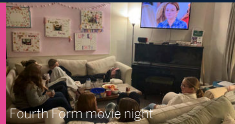
Fourth Form movie night