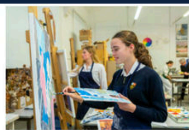
7 DECEMBER 2024 WELCOME MORNING - DECEMBER