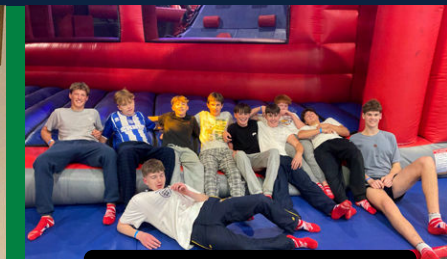
Upper Fifth trip to Ninja Warrior