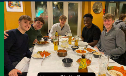
Upper Sixth Curry