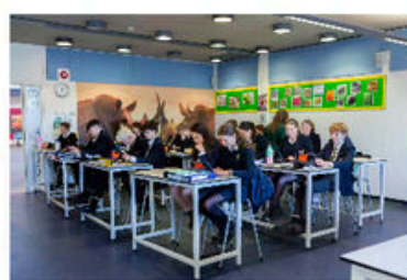
14 JUNE 2025 OPEN DAY