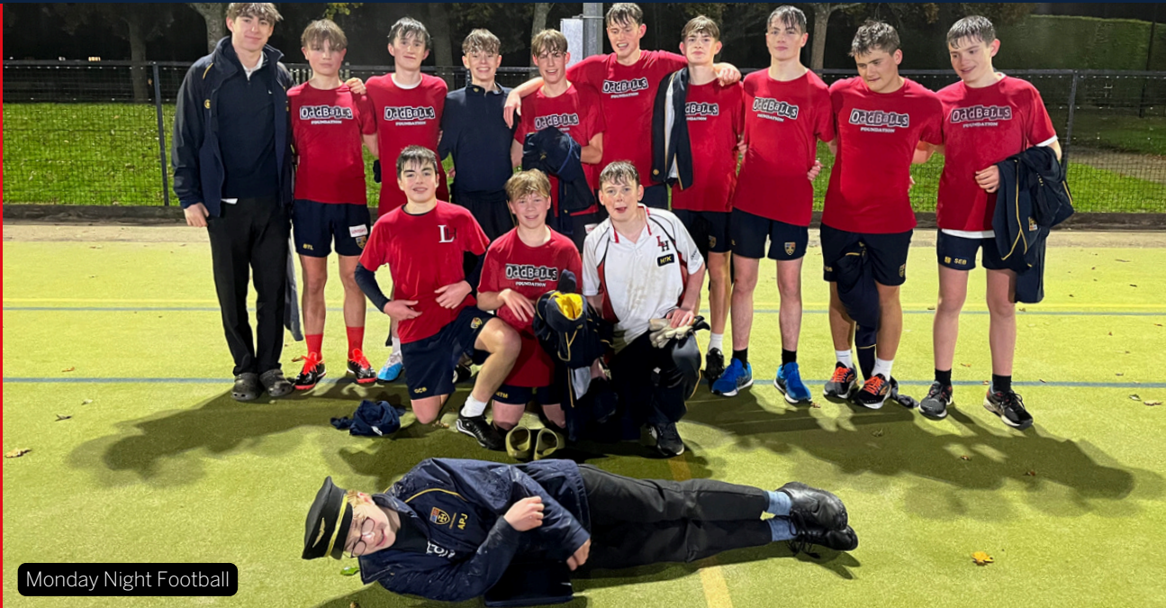
Monday Night Football