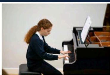
22 NOVEMBER 2024 JUNIOR LUNCHTIME CONCERT