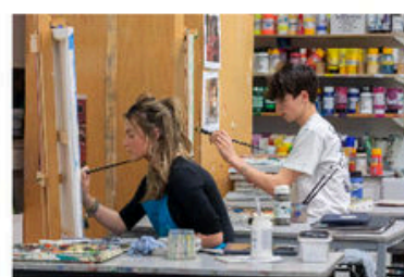
21 JUNE 2025 SIXTH FORM WELCOME MORNING (16+) JUNE 2025