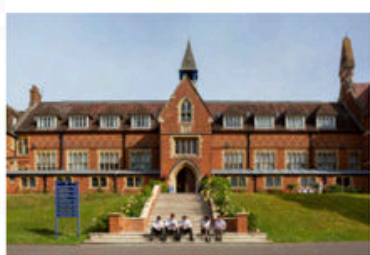
1 MARCH 2025 WELCOME MORNING - 1ST MARCH