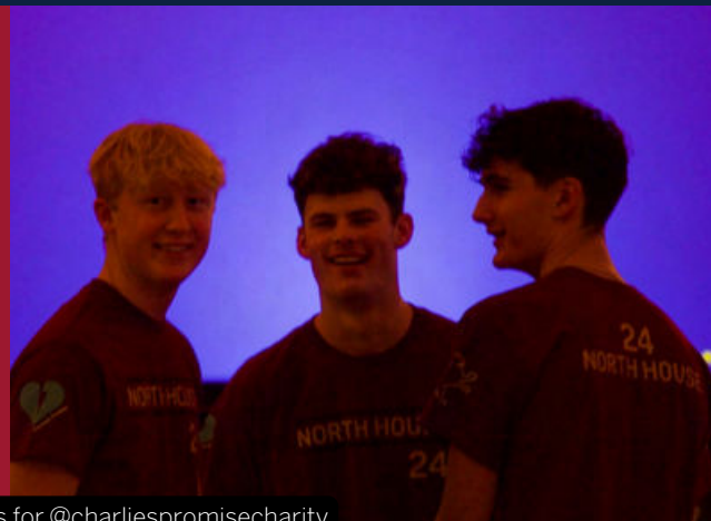
Charity Night raising funds for @charliespromisecharity