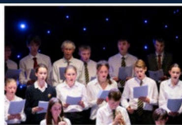
6 DECEMBER 2024 CHRISTMAS CONCERT