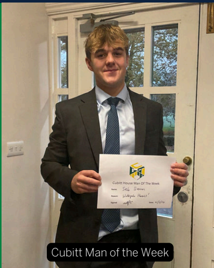
Cubitt Man of the Week