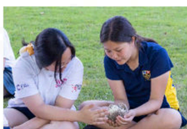
1 MARCH 2025 WELCOME MORNING - 8TH MARCH