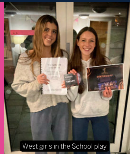
West girls in the School play