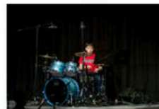
19 MARCH 2025 JUNIOR AND SENIOR DRUMS COMPETITION MUSIC