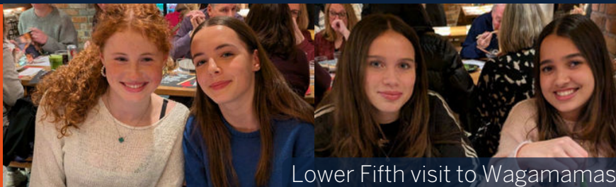
Lower Fifth visit to Wagamamas