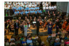
21 MARCH 2025 MERRIMAN ORCHESTRA CHOIR CONCERT MUSIC