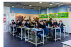
14 JUNE 2025 OPEN DAY OPEN EVENT