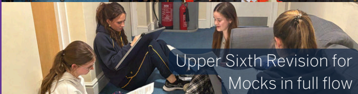
Upper Sixth Revision for Mocks in full flow