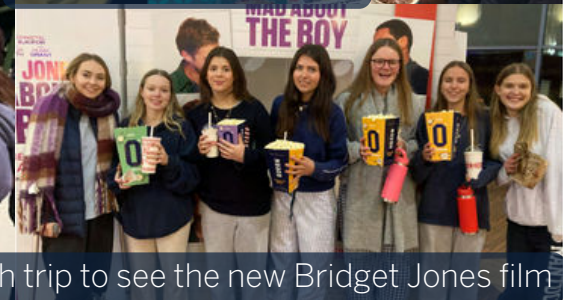
Lower Sixth trip to see the new Bridget Jones film