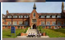
1 MARCH 2025 WELCOME MORNING – 1ST MARCH OPEN EVENT

To book tickets, visit the Upcoming Events page on our website or click here .