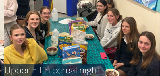
Upper Fifth cereal night