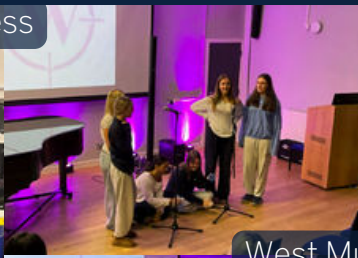
West Music night