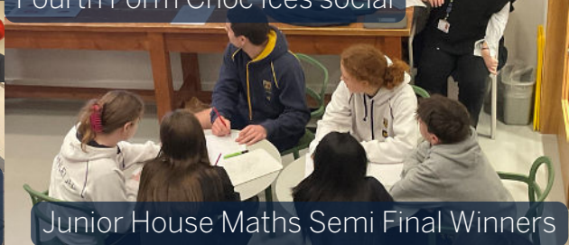
Junior House Maths Semi Final Winners