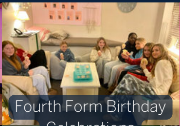
Fourth Form Birthday Celebrations