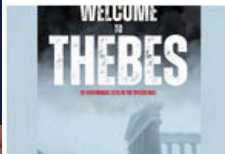
14 MARCH 2025 SCHOOL PLAY: WELCOME TO THEBES DRAMA