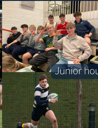
Junior house maths