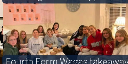
Fourth Form Wagas takeaway