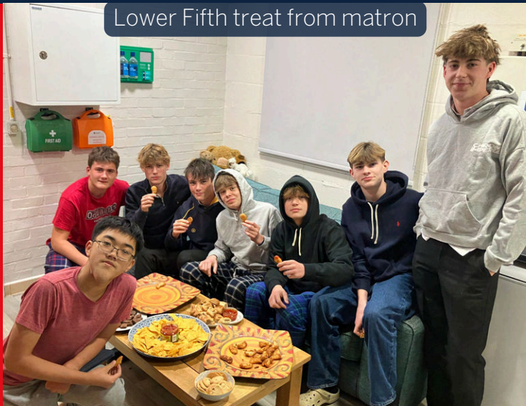
Lower Fifth treat from matron