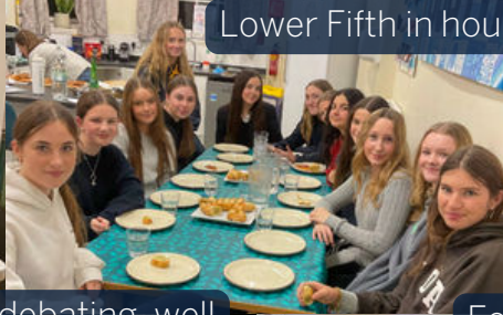
Lower Fifth in house dinner