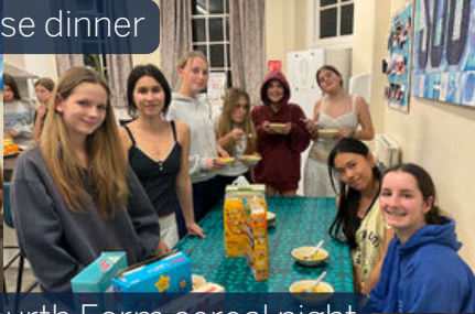
Fourth Form cereal night