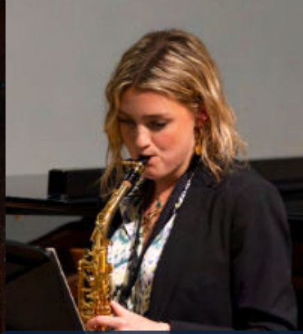
Senior Wind, Brass and Piano Competition