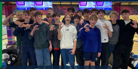
Lower Fifth bowling trip