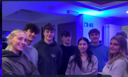
Martlet/East Sixth Form Cheese and Wine Social