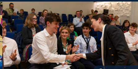
Senior music competitions