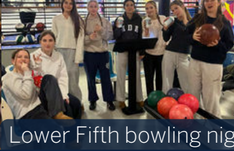
Lower Fifth bowling night