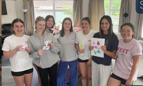
Stars of the week!