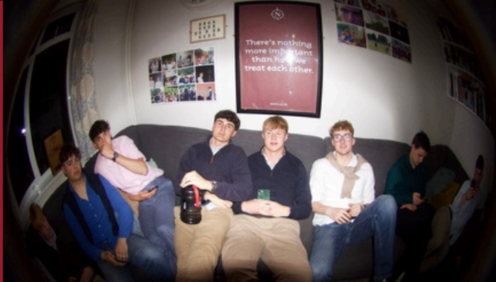
some still photos from Dhavid's fish-eye lens from last Friday evening