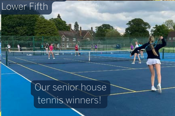
Our senior house tennis winners!