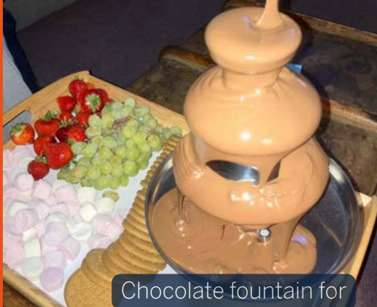
Chocolate fountain for the Lower Fifth