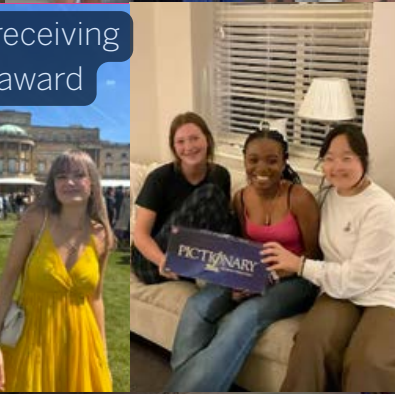
Lower Fifth Social