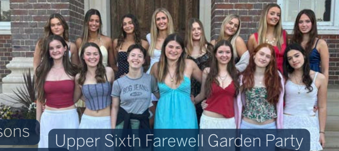
Upper Sixth return as juniors for their final lessons