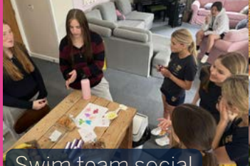
Swim team social