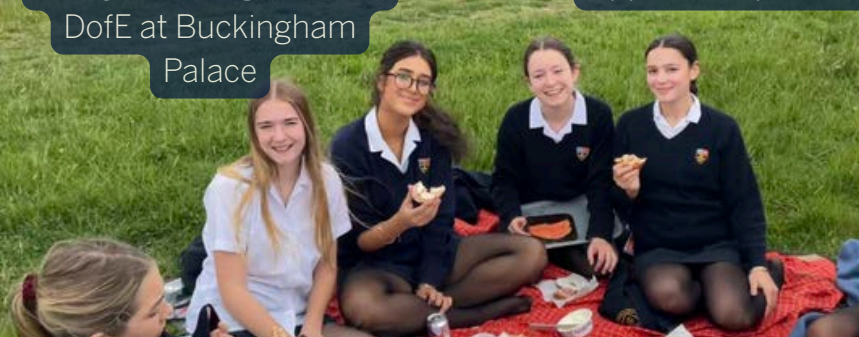
Upper Fifth picnic to celebrate the start of study leave