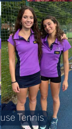
Senior House Tennis